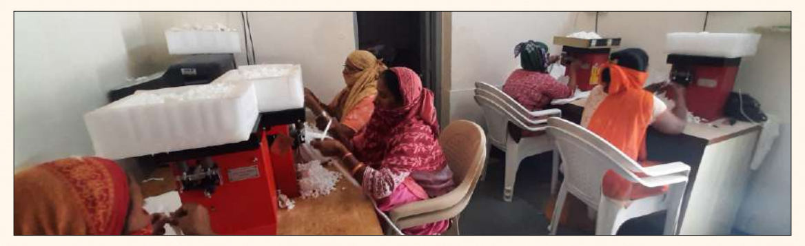
"Cotton Wick" Divet Making Project