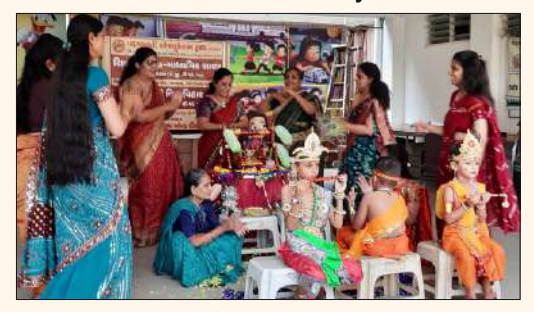
Janmastami Celebration for KG Students