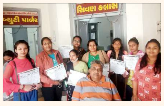
Certificates given at completion of 3 month Course