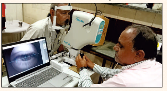
'FORUS' Fundus camera in Eye Department