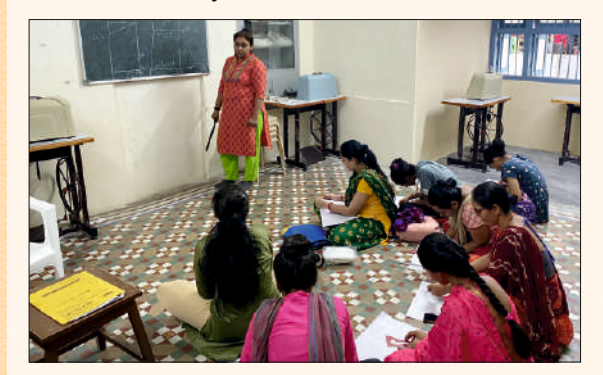
View of Tailoring Class

At present, 8th batch of coaching classes are in progress. At the end of three months course, formal examination assessment is done and are issued certificates. We are happy to inform you all that nearly 40 to 50% girls have started earning and supporting their family financially by starting business activity.