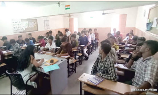
View of Classroom of Sanjivani ELC "MASOOM" Center

This year nearly 110 students had been enrolled, of which 70 to 80 % of students had regularly Attended the evening class, and in 2022 March they scored 58% result at Board Examination including re test for failed students in July 22.