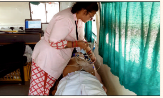
ECG Being Taken in Medical Van