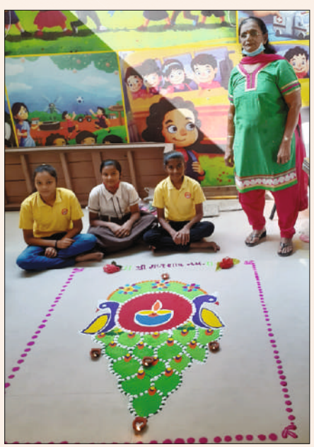
Rangoli Competition at our School