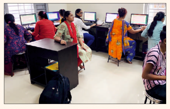
View of Commuter Class