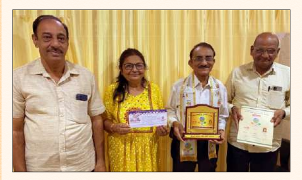
Volunteers with Award